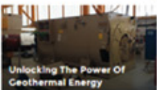
Unlocking The Power Of Geothermal Energy