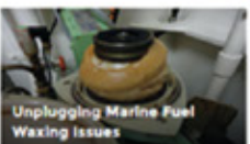
Unplugging Marine Fuel Waxing Issues